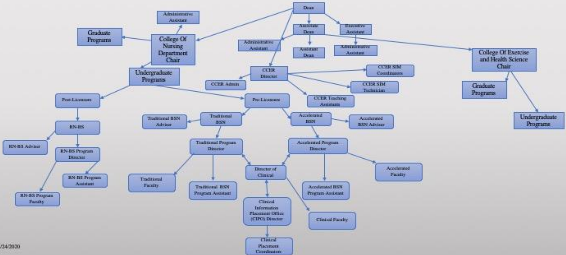
University of Massachusetts Boston College of Nursing and Health Sciences Organization Chart (Partial)