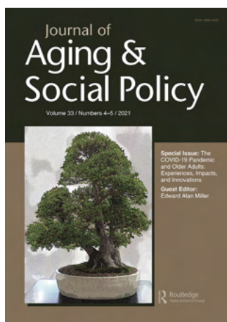
Journal of Aging and Social Policy