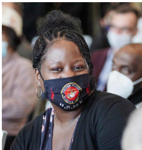
Students, staff, faculty, administrators, and service members past and present joined the Veterans Day celebration in the Campus Center.