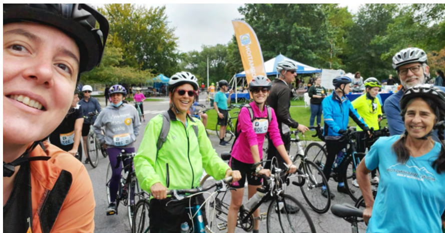
The UMB Ride for Food Team before the event