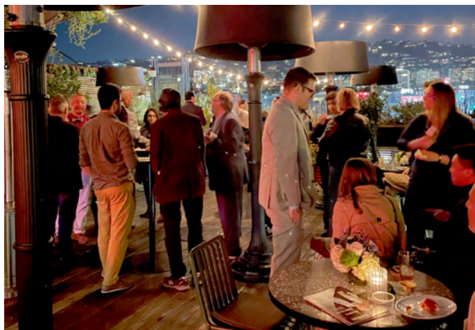
Beacon alumni came together in Los Angeles this fall.