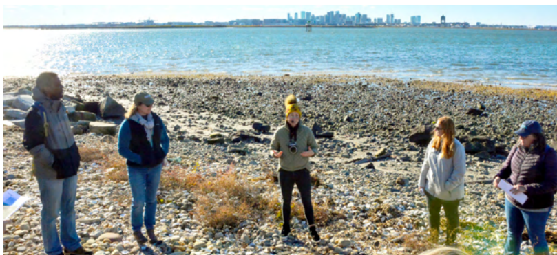
Participants learn about a shoreline restoration project at Coughlin Park in Winthrop during a conference field trip.

The report's inaugural ranking of undergraduate nursing programs vaulted UMass Boston high on the list, joining several other top-ranked programs at the Manning College of Nursing and Health Sciences. Earlier this year, U.S. News ranked the school as No. 63 on its list of best master's in nursing programs, and No. 86 on its list of best doctor of nursing practice programs.