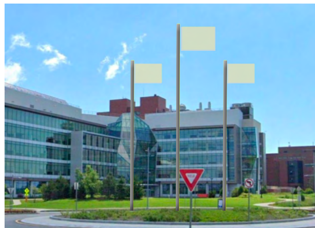
Rendering of the completed rotary island and flagpoles