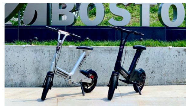
Wheels electric bikes arrived on campus on October 15.

Since undergoing major construction, the university has not had flagpoles. These flagpoles will fly the American flag, the POW flag, and the university flag to greet commuters and visitors to our campus.