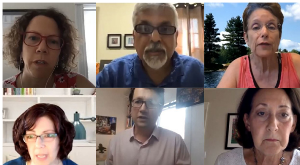
Six faculty members participate in a Teach Fall 2020 informational session.