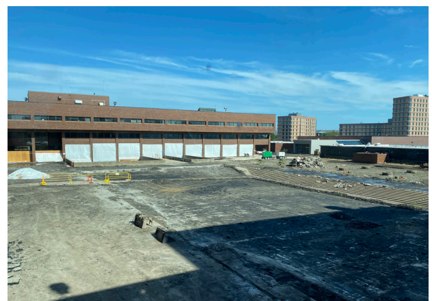
Work has begun to remove the plaza.

Contractors have already started “soft stripping” the Science Center, the pool building, and the plaza. Preparation work included removal of the trees on the plaza; as part of the new quadrangle, there will be replacement trees planted to transform the area into a beautiful and functional centerpiece of the campus.