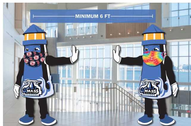
Mascot Bobby Beacon demonstrates how to social distance on campus.