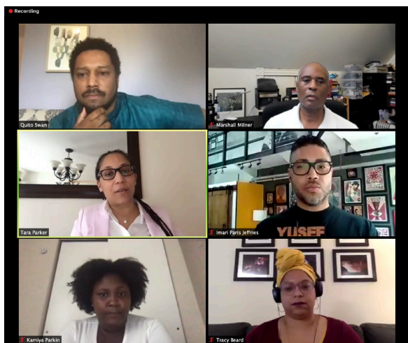
Panelists discuss how UMass Boston can address racial injustice on campus and beyond.