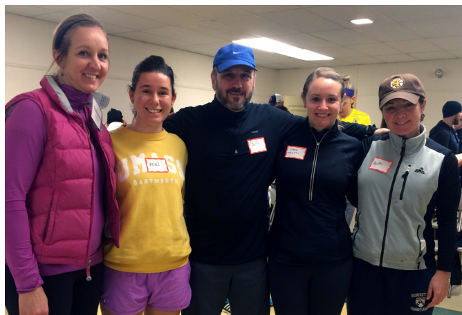
Members of the University of Massachusetts Boston Marathon team who are running in support of the Krystle Campbell Scholarship Fund.