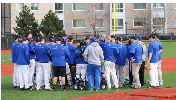
The Beacons are enjoying their first baseball season at home on Columbia Point at the newly opened J. Donald Monan, SJ Park.

In the coming months, UMass Boston looks forward to the completion of the building's recital hall, theater, 500-seat auditorium, additional classrooms, and other specialized teaching areas. The 190,000-square-foot building ultimately will provide nearly 2,000 classroom seats, faculty and staff offices, a café, student lounge and study spaces, and specialized instructional space for three academic departments: art, chemistry, and performing arts. University Hall will support the university's strategic plan to expand academic offerings and grow enrollment.