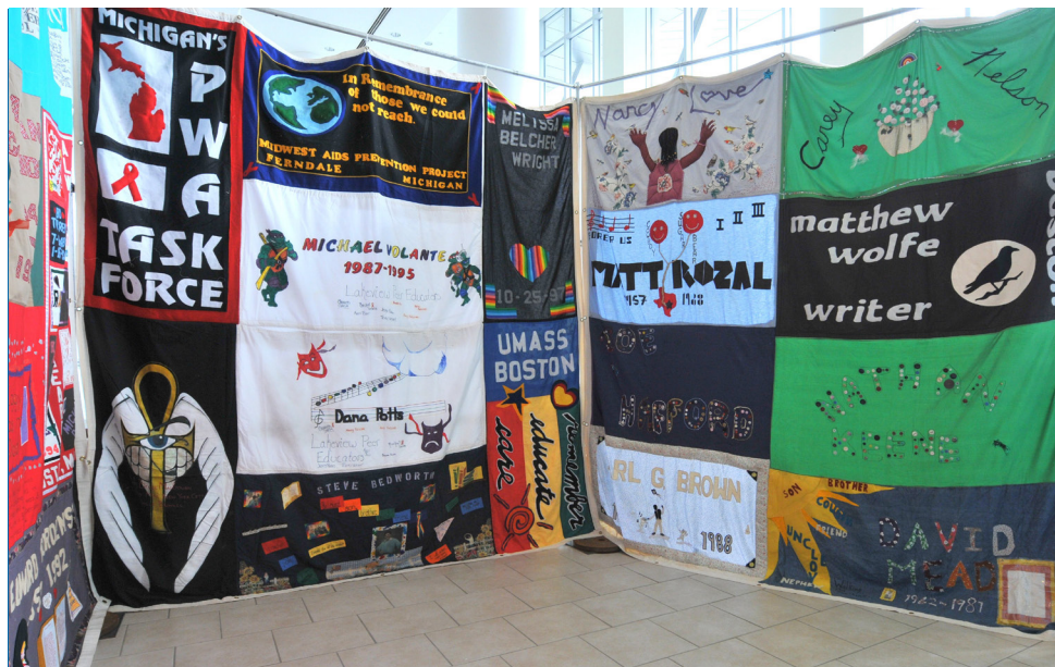
Sections of the AIDS Memorial Quilt were on display in the Campus Center in December.