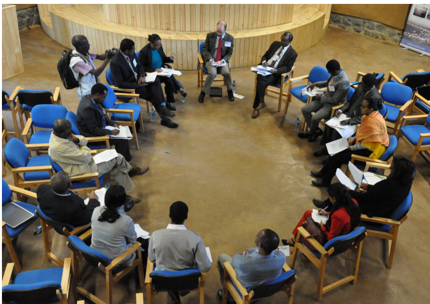
A negotiation simulation held during the Regional Environmental Diplomacy Institute—Africa.