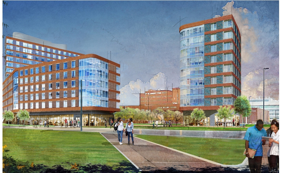
A rendering of UMass Boston's future student housing, set to open in 2018.